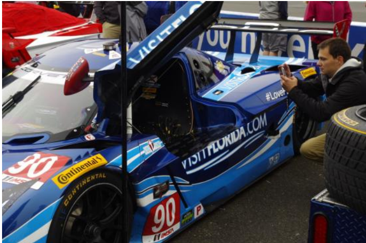
Take a look on the inside....