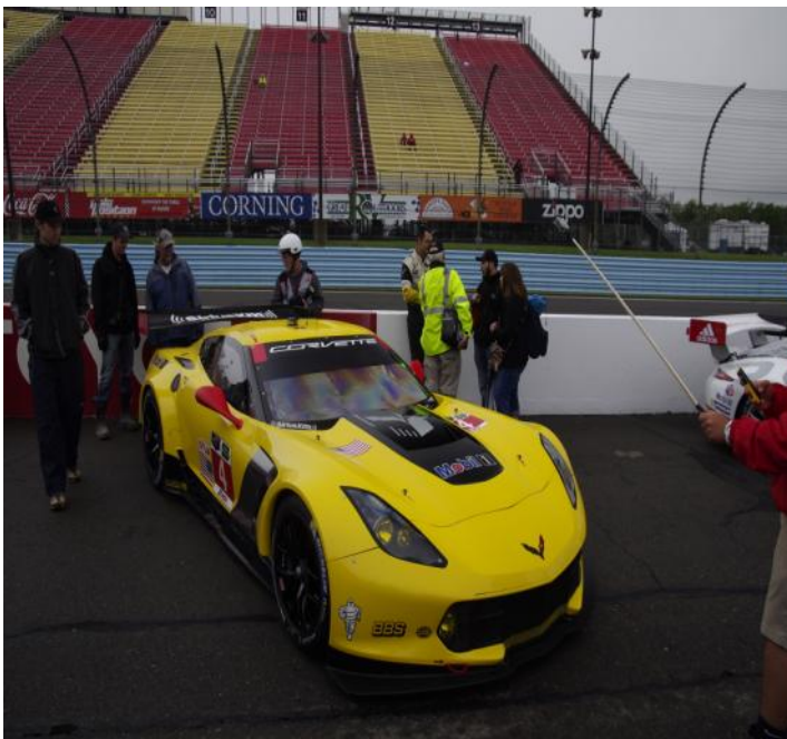
Doug & Maile Willrich

It was a real treat to see these very fast, high tech Corvettes racing at this famous track, one of things I just needed to do. The area offers a lot to do and see, all in very beautiful surroundings. Not too far away for a CGCC caravan !!