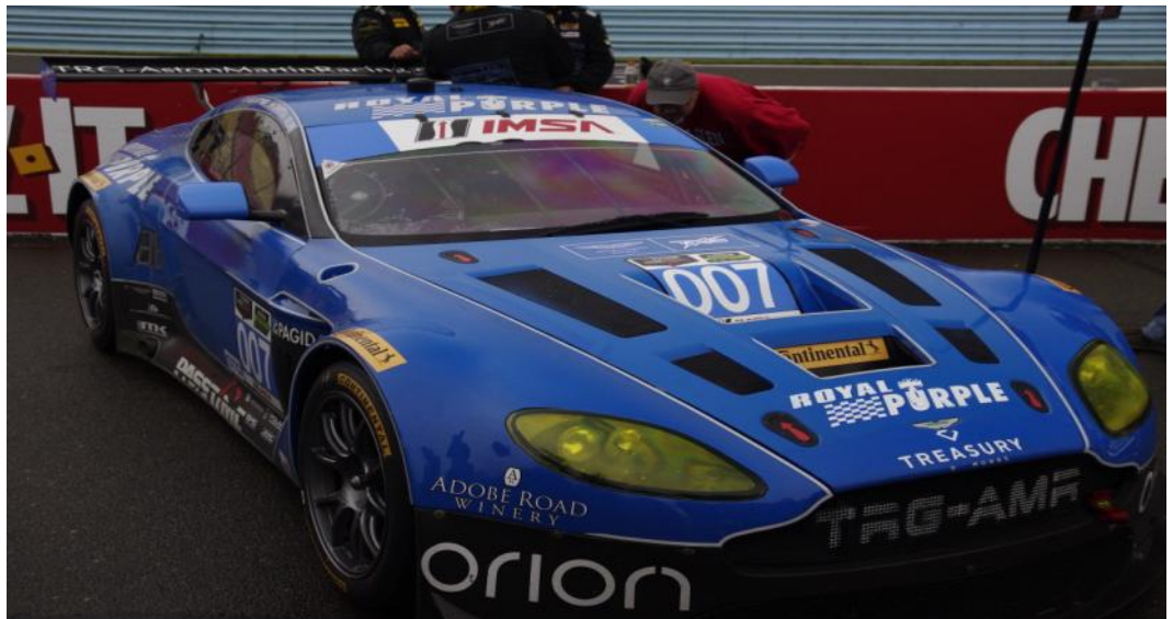
James Bond ??????