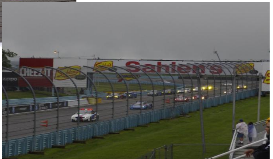
The finish after a VERY long day....