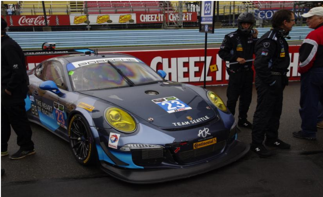
Check out the name on the nose ....