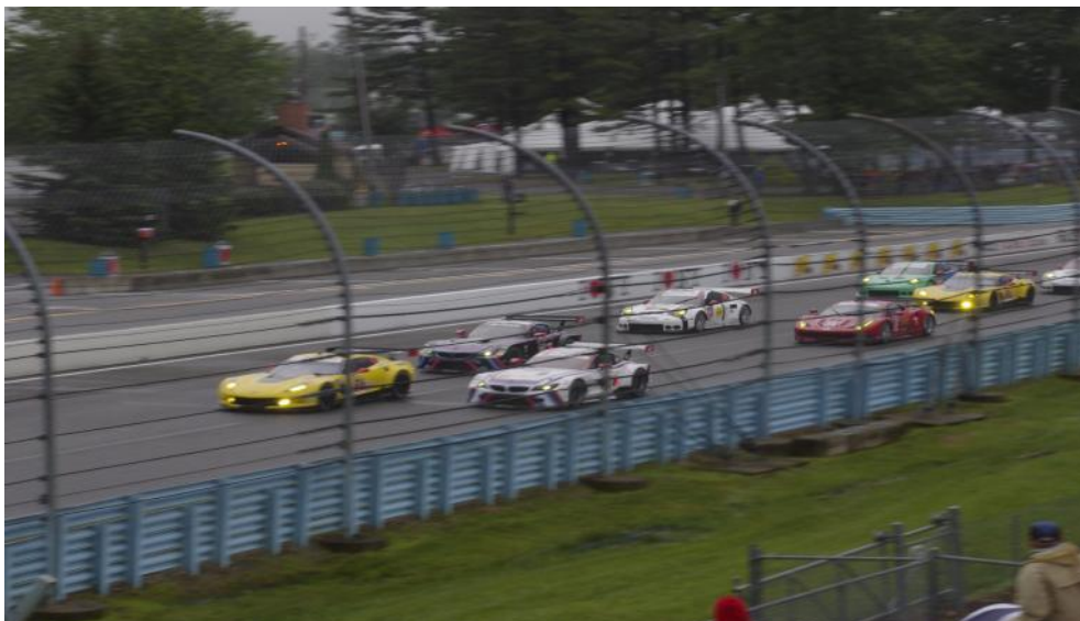
Safety car got a lot of miles.